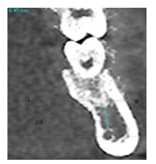
Figure 2. Distance measured in the context of the inferior alveolar nerve canal.

D3. The shortest distance from the outer surface of the IANC to the nearest root surface.