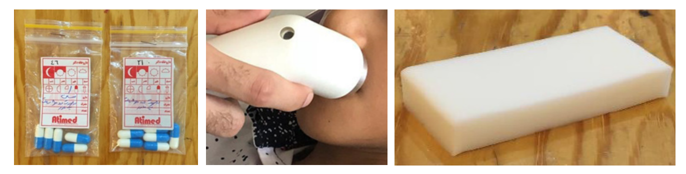
2A. Ibuprofen and placebo in undistinguishable capsules. 2B. LIPUS irradiation after initial archwire placement. 2C. The rectangular and flexible block of silicone used for biting on during this study.

Figure 2. Materials and technique used in the study.