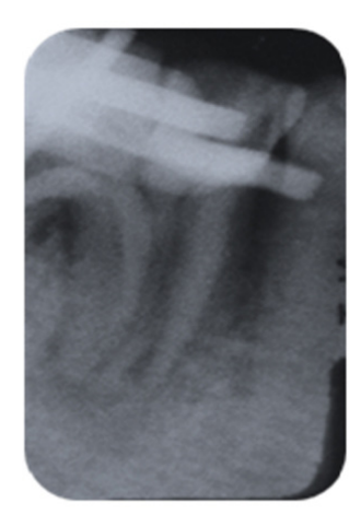
Figure 5. X-ray showing fracture extension.

lingual cusp. (Figure 4) Radiographically, a new increase in root length (16mm) and, most importantly, the presence of the apical barrier could be seen. Afterwards, the parents and the patient were informed on this condition occurred after 10 months of treatment and interconsultation with pediatric dentistry was requested. They suggested removing the tooth and placing a space-maintainer until the patient was old enough to place a dental implant (Figure 5).